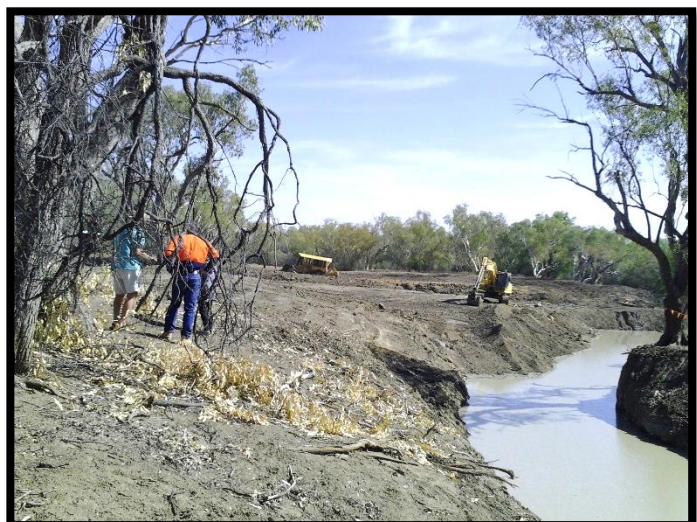
Flood Mitigation Project – 4 Mile