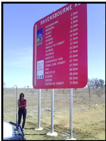
Emergency Services Sign for Ravensbourne Road